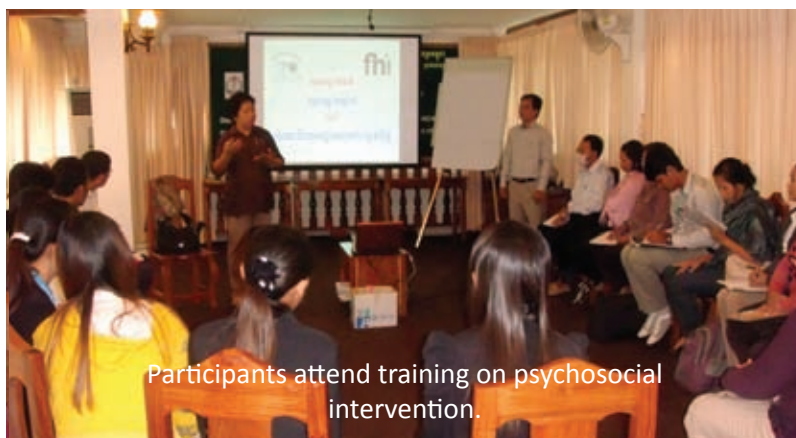
Participants attend training on psychosocial intervention.

psychology, social work, psychiatry or psychiatric nursing. Besides running the training service, TPO trainers offer clinical supervision to trainees to enable them to put the knowledge from the training into practice.