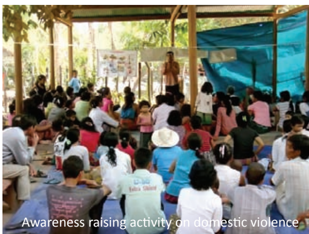
Awareness raising activity on domestic violence

The aim of this project is to improve the psychological wellbeing of victims of domestic violence and of men suffering from alcohol dependence (who often abuse their spouses when drunk), eventually leading to improvement in their livelihood and reducing poverty.