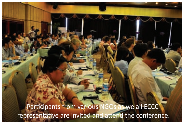
Participants from various NGOs as well as ECCC representative are invited and attend the conference.

TPO in cooperation with the Berlin Centre for the Treatment of Torture Victims (bzfo) organized a conference on 'Victim Participation and Psycho-Social Needs in the Context of the ECCC' on 17 th of December 2010 in Phnom Penh. The conference was funded by the German Ministry for Foreign Affairs. In organizing this conference, TPO aimed to present and discuss data on victim participation at the ECCC and mental health of Khmer Rouge torture survivors as well as to initiate a broader discussion as to how psycho-social concepts and practices can be best integrated into future non-judicial measures for victims of Khmer Rouge in Cambodia. The presented study results included – among others - civil parties' perceptions toward justice and reconciliation, their expectations toward the ECCC, their experiences with participation in Case 001, their perceptions of the