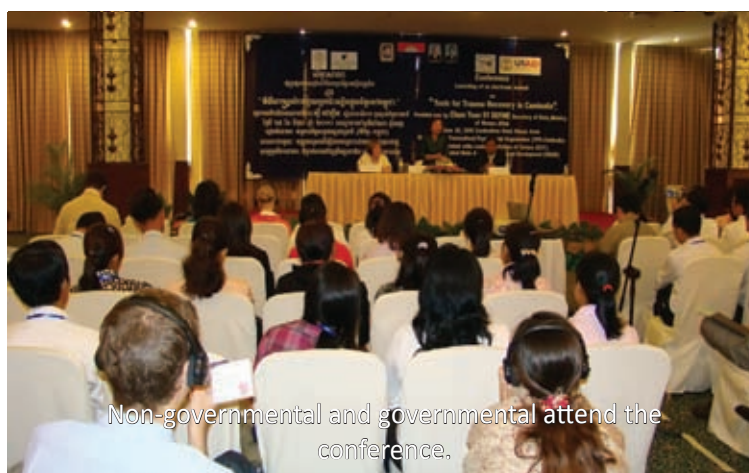
Non-governmental and governmental attend the conference.

The manual contains a mix of training slides, short video lectures, audio narration of case examples, and demonstration videos. The materials have been tested and reviewed in the THI training process with Cambodian professionals. This