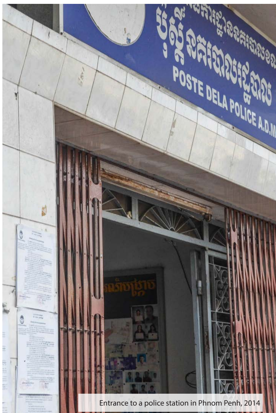
Entrance to a police station in Phnom Penh, 2014