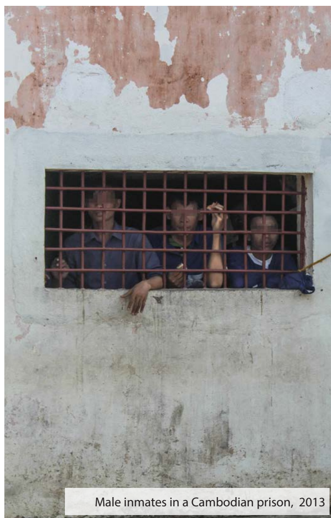
Male inmates in a Cambodian prison, 2013