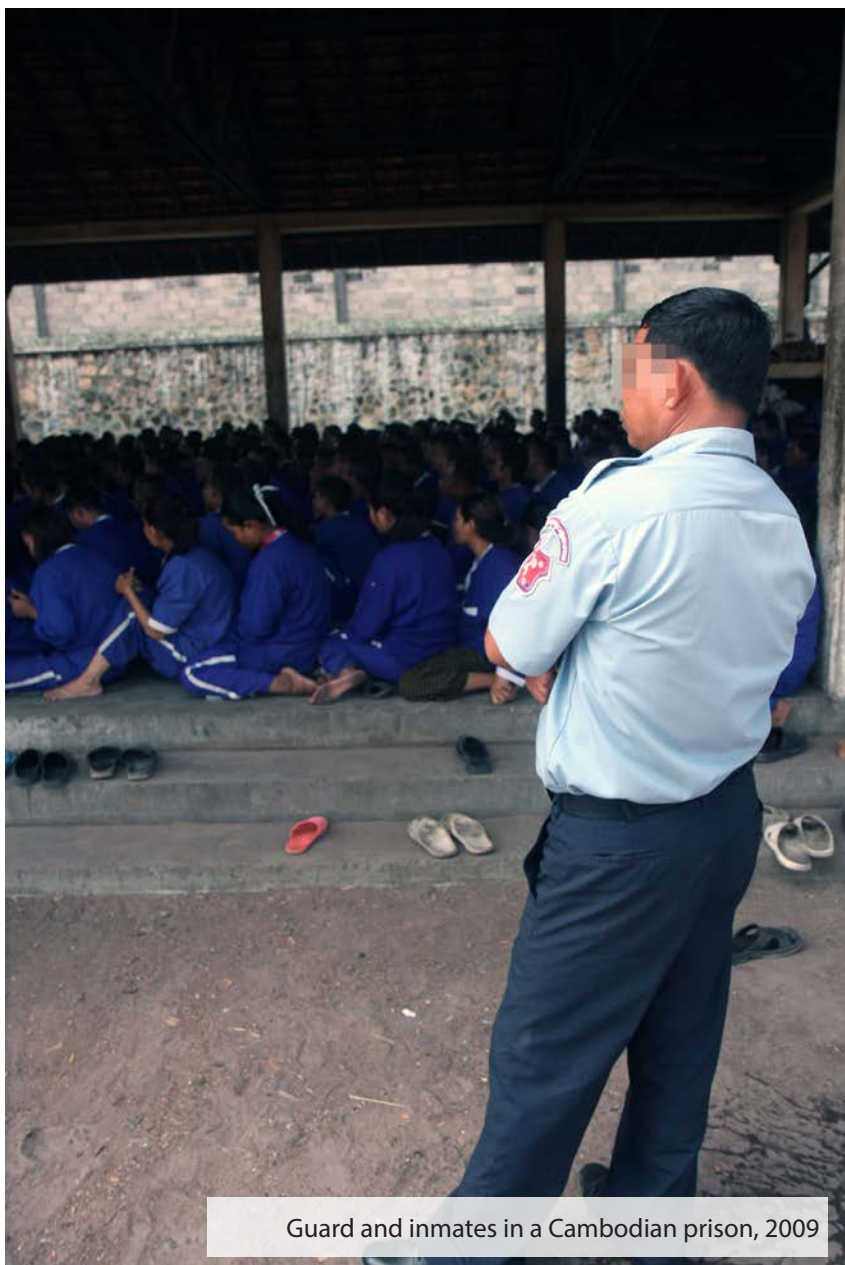
Guard and inmates in a Cambodian prison, 2009

On another occasion the same inmate complained about the unfair allocation of prison food and found himself beaten by prisoners who, according to him, enjoyed a close relationship with prison guards. When he reported these beatings, no action was taken.