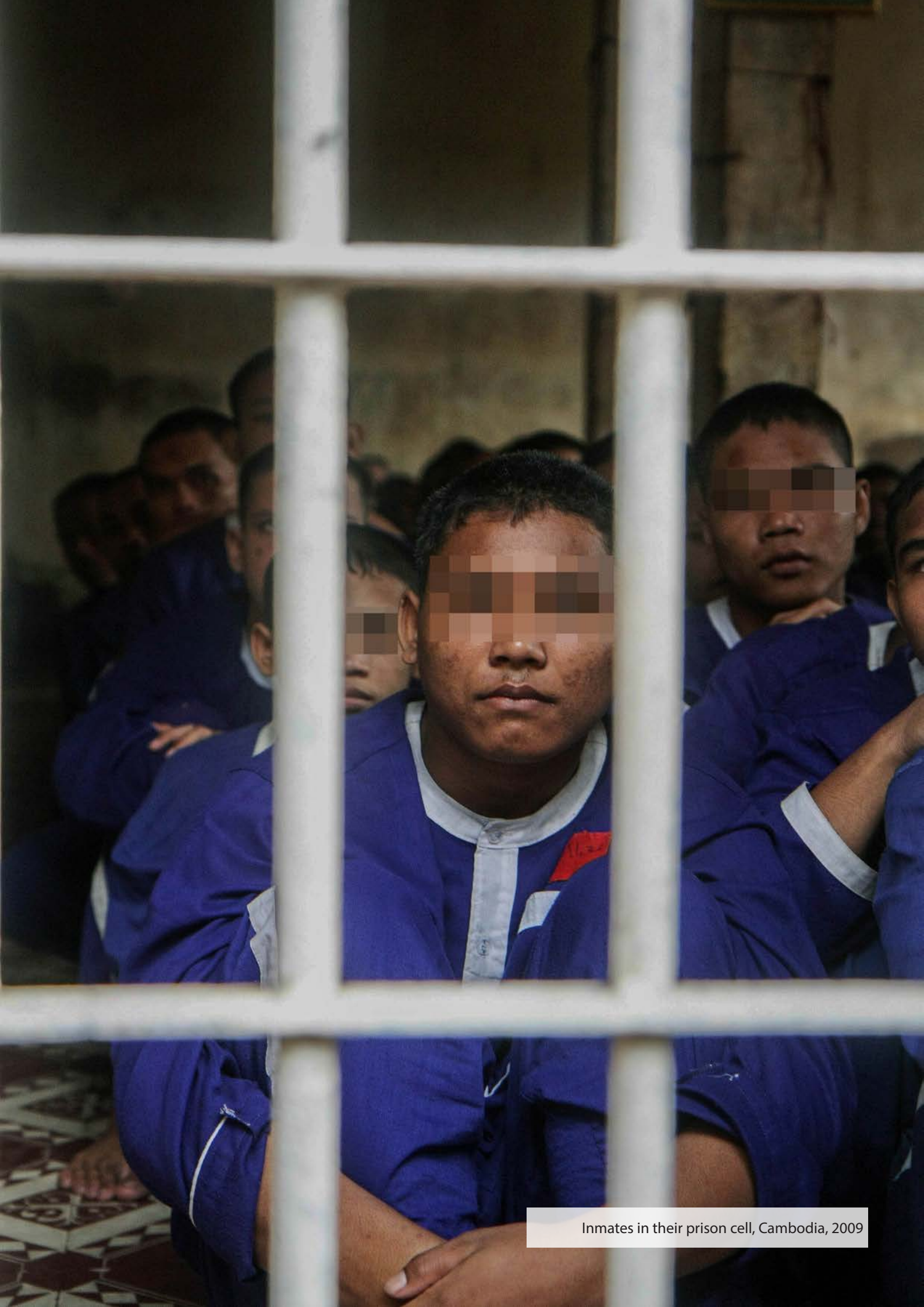
Inmates in their prison cell, Cambodia, 2009