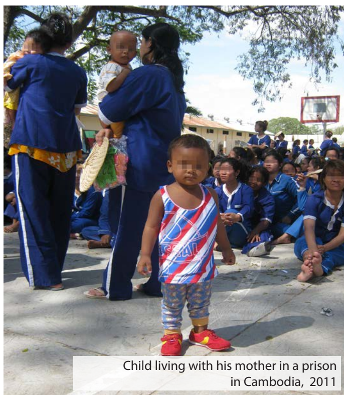
Child living with his mother in a prison in Cambodia, 2011

In this, prison authorities need the full commitment and support of the Ministry of Social Affairs, Veterans & Youth Rehabilitation (MoSAVY), the agency which should be responsible for leading the assessment of appropriate custodianship and the safe removal and relocation of a child from prison. Unfortunately, to date, this commitment and support has been woefully lacking.