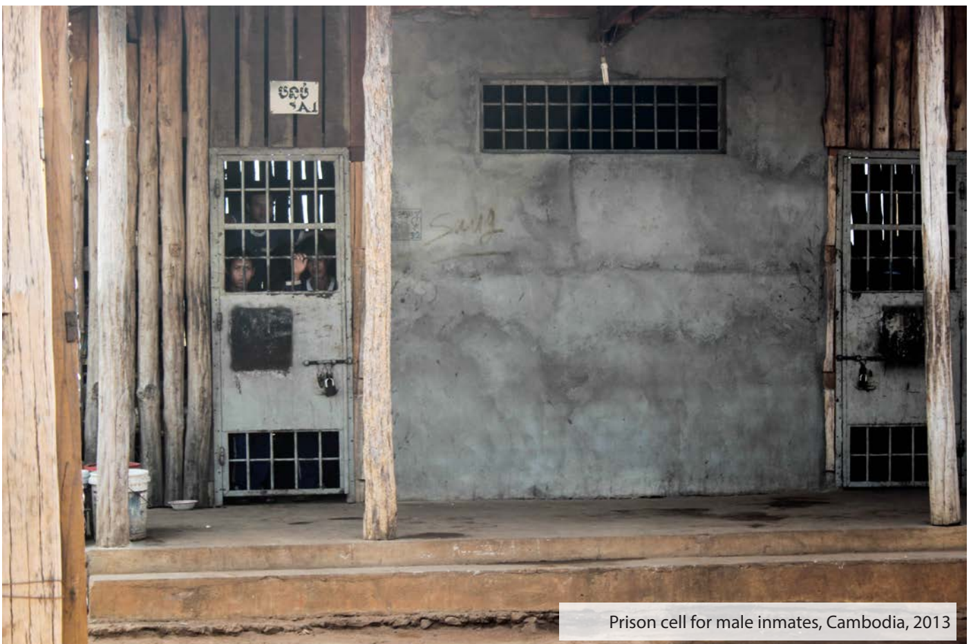
Prison cell for male inmates, Cambodia, 2013

Whilst men, women and children continue to be beaten, threatened and maimed in the custody of the State, Cambodian authorities must accept that they bear direct responsibility and must take immediate steps to introduce stronger safeguards and accountability mechanisms.