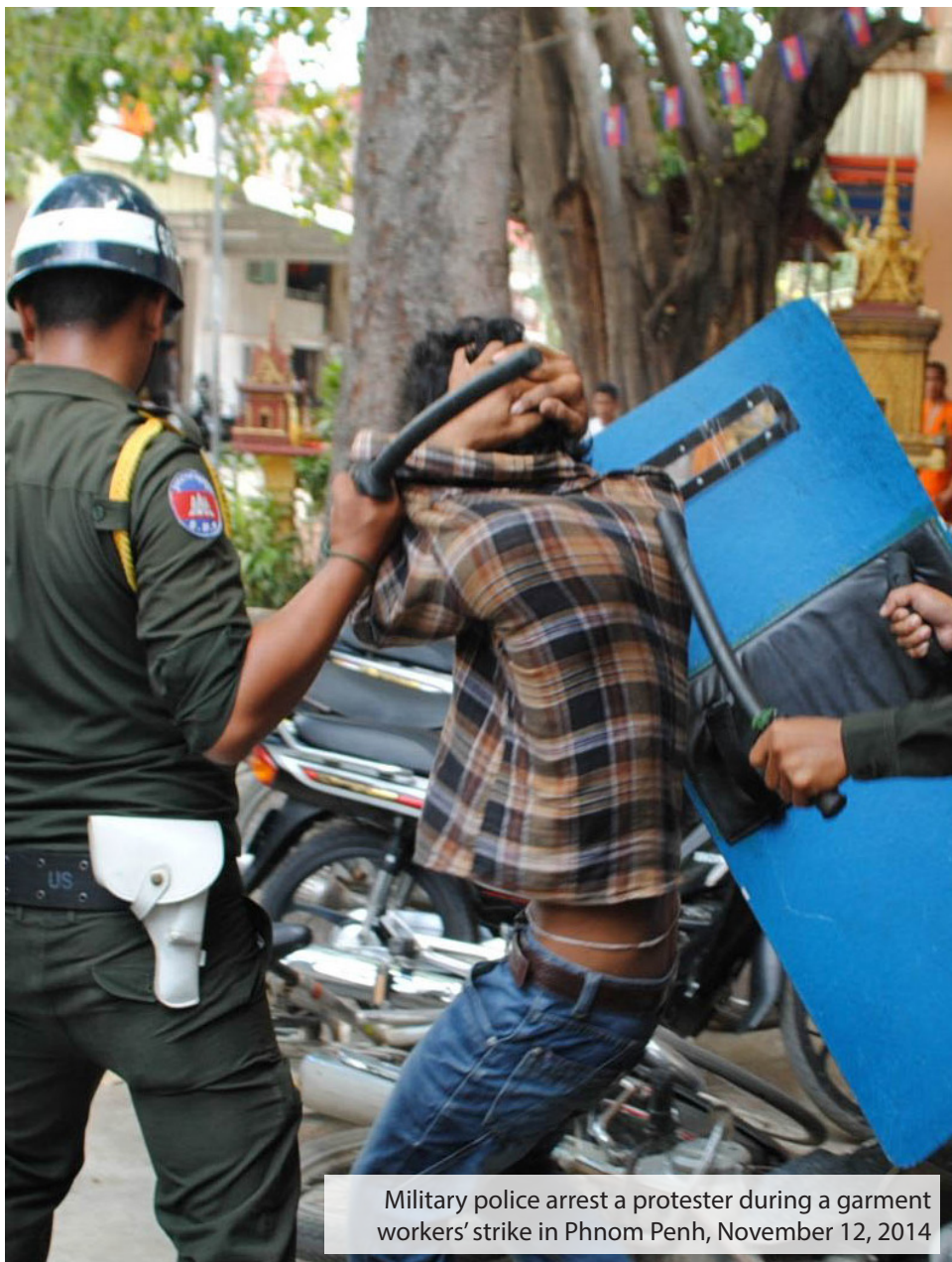
Military police arrest a protester during a garment workers' strike in Phnom Penh, November 12, 2014