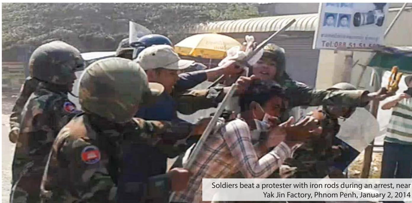
Soldiers beat a protester with iron rods during an arrest, near Yak Jin Factory, Phnom Penh, January 2, 2014

Abuse during transit to police custody is also common, with officials sometimes beginning the interrogation process at this stage to take advantage of the suspect's state of initial shock and vulnerability.