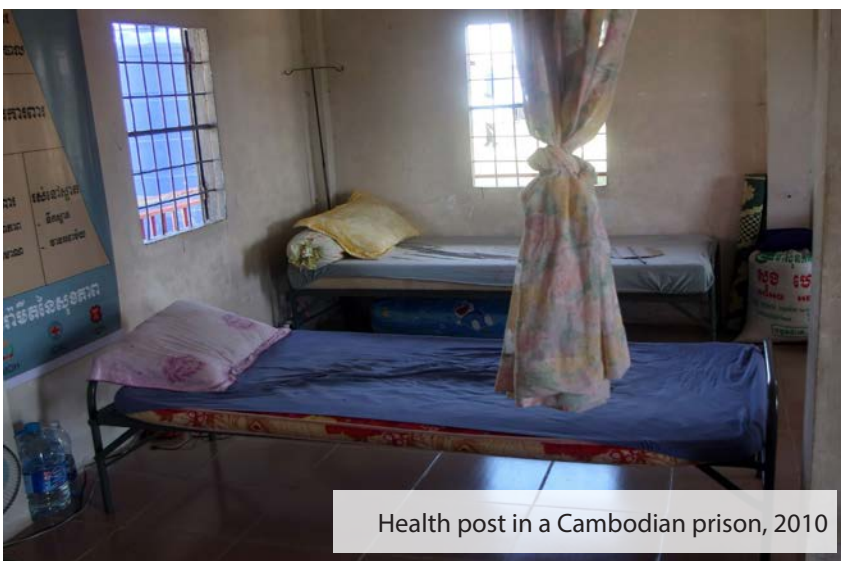
Health post in a Cambodian prison, 2010