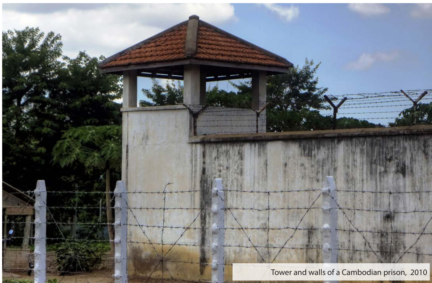
Tower and walls of a Cambodian prison, 2010