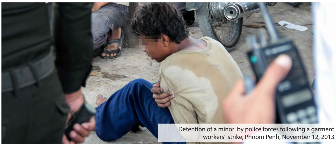
Detention of a minor by police forces following a garment workers' strike, Phnom Penh, November 12, 2013

There is certainly greater and more detailed external scrutiny of prisons than there is of police stations, including by LICADHO, the International Committee of the Red Cross (ICRC) and the UN Office of the High Commissioner on Human Rights (UNOHCHR) Cambodia. This scrutiny, combined with improved training of prison guards, has undoubtedly led to reduced levels of violence by prison officials. However, LICADHO's research also shows that the culture of abuse in prisons is far more complex than that in police custody.