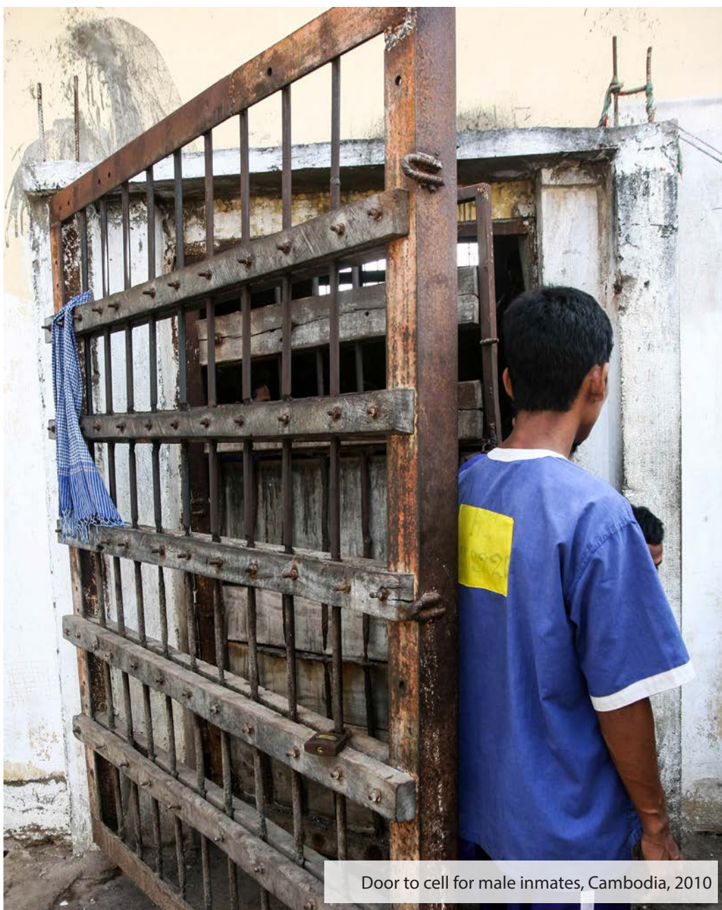
Door to cell for male inmates, Cambodia, 2010

Male who reported abuse between 2010 and 2012