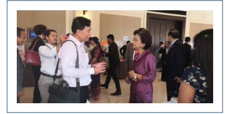
TPO's Executive Director explained Minister of MOWA about TPO's work during exhibition event of DFAT on 21 March.

As a partner, TPO Cambodia has had the great honor to join an exhibition about achievements during the launching of the project called 'Australia-Cambodia Cooperation for Equitable and Sustainable Services' organized by DFAT on 21 March 2019 at the Australian Embassy as well.