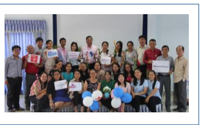
Woman day celebration on 6 March at TPO office