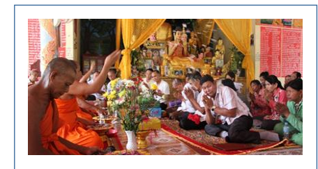
Testimonial Therapy Ceremony in Svay Rieng on 8 March.

This activity is part of the Healing and Reconciliation for Victims of Torture during the Khmer Rouge Regime Project and funded by USAID.