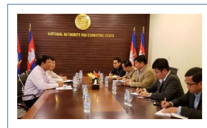
The meeting between TPO National Authority for Combating Drugs of the Ministry of Interior on 25 March, 2019