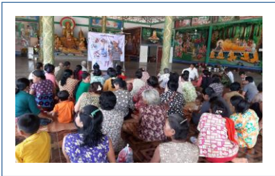
Psycho Social Awareness Raising Sessions in Chambork village, Thmor Pich commune, Tbong Khmum province, March 2019.

After that, all staff joined to spread message to promote women right, acknowledge messages with some wishes to all the women to get the rights, freedom, peace and development, happiness, healthy both mental and physical following by solidarity lunch together.