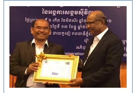
TPO's representative received NGO GPP-Certificate at awarding ceremony on 13 December

In honor of TPO's efforts to comply with NGO GPP, TPO's representatives were invited to receive a certificate and an award during the certificate awarding ceremony on 13 December 2018 organized by CCC. For further info about this code, see the Cooperation Committee for Cambodia's (CCC) website: http://www.ccc-cambodia.org