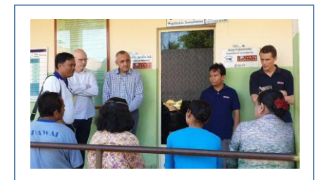
Belgian Ambassador, LC & TPO Management team meeting with beneficiary group in Chamkarleu hospital.

The Ambassador met with doctors who provided mental health services in Chamkarleu hospital to observe treatment with medication, counseling, and mental health awareness raising/education. He also met with a village support group and the head of the district health department in Chamkarleu to discuss project planning and sustainability.