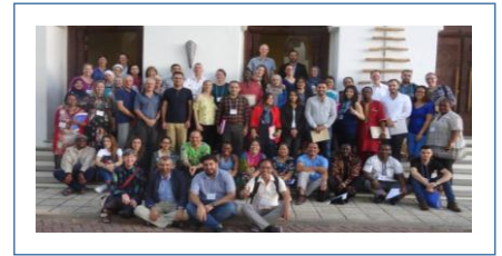
All participants of Partners in Trauma Healing workshop in Tanzania

This workshop offered CVT's partners from various countries capacity building opportunities related to mental health counseling, monitoring and evaluation, and organizational development. The aim is to provide more effective treatment for torture survivors, to build communities across all areas of technical expertise, and share the overall vision of CVT to mitigate suffering of torture survivors.