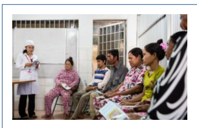
Psycho-education by nurse at referral hospital in Chamkarleu

In line with strategic plan of the Ministry of Health related mental health services, TPO has continued activities in Tboung Khmum and Kampong Cham provinces with the objective of 'strengthening local mental health systems.' The project, funded by Louvain Coopération https://www.louvaincooperation.org/?lg=en aims to ensure that 'Cambodian people, especially the vulnerable groups (women, children and old people) will have access to the highest quality of mental health service through promotion, prevention, treatment, and rehabilitation, contributing to a long and healthy life.' Target groups are out-patient department staff working at Referral Hospitals and Health Centers as well as Village Health Support Groups. Patients and their families as well as community members also benefit from the project.