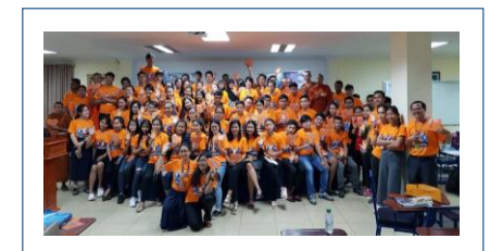
16 days of Activism against GBV event, 4 December, 2018.

This video was prepared by TPO team working in the project 'Reconciliation and Healing' project funded by United States Agency for International Development (USAID).