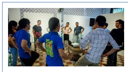
Self-care session for staff of Bophana Center on 13 Oct 2017.