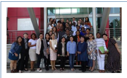
Four TPO staff and CVT partners attended PATH workshop in South Africa on 23-27 Oct, 2017.