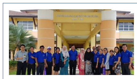
All TPO's therapist visited Rehabilitation Unit of chronic patients at Hospital Permai, Johor Barhu in Malaysia on 6 Dec during TPO Annual Conference 2017.

https://www.facebook.com/coolfmp/videos/1429489627141542/