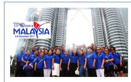
Photo of all TPO staff in front of twin tower building, Malaysia during TPO Annual conference 2017

https://www.facebook.com/tpocambodia/posts/1726908620700214