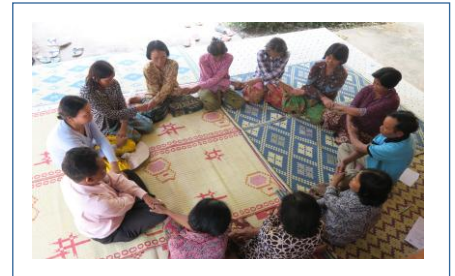
Meditation at the end of SHG Reflection in Banteay Meanchey

This campaign was also published on TPO’s website & facebook as well as GBV’s facebook which reach to thousand of people as below link: https://www.facebook.com/tpocambodia/videos/1718304111560665/ & https://www.facebook.com/151437704957133/photos/pcb.1205414129559480/1205406352893591/?type=3&theater .