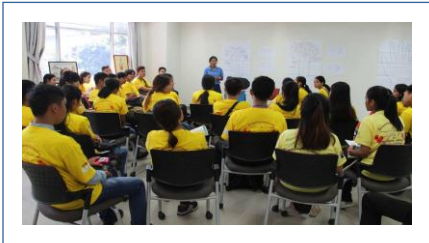
TPO's counselor introduced self-care techniques to a group of youth during Mental Health Day at RUPP

TPO has developed a format to teach self-care to individuals and teams to improve well-being, reduce stress and prevent mental and physical disease. Bophana Center was one of the first to try it out on 13th October 2017 with 15 employees. They utterly enjoyed to learn practical self-care with mental and physical activities and appreciated all the new knowledge they received asking for a 2nd workshop.