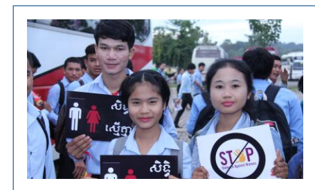
Campaign to end violence against women conducted in Siem Reap province on 30 November