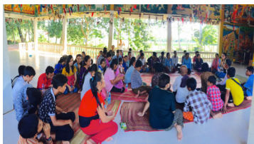
Community dialogue activity

The targeted groups are individuals who were tortured during the Khmer Rouge (KR) regime and are still struggling with trauma symptoms,