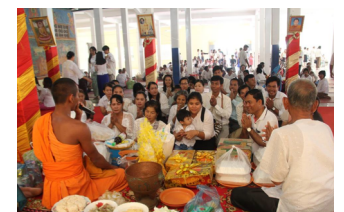
TPO Staff celebrated Pchum Ben ceremony at a pagoda in Phnom Penh (Wat Chum) on 23 September