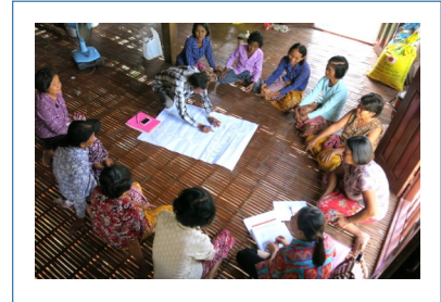
Self Help Group activity for GBV survivors in Prey Veng Province