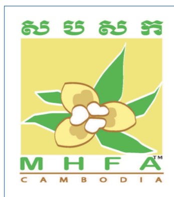
Logo MHFA-Cambodia Designed by TPO