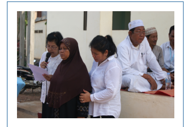
TPO's counselor read a testimony of a survivor in the process of ceremony with Cham

The video is produced in the former KR and Victim-Survivor dialogue program is implemented under the Truth, Reconciliation, and Healing project funded by USAID.