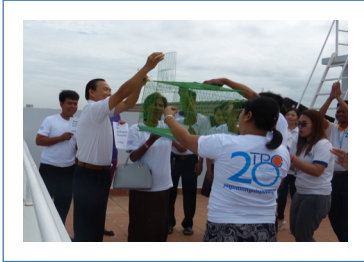
TPO staff and Torture survivors free birds on TPO rooftop as a symbolic act for Torture survivors

In 2016, TPO Cambodia highlighted the 26 th June as International Day in Support of Victims of Torture by joining to spread the camping message from partners, as well as organizing an event on June 23 rd in honor of torture survivors of the Khmer Rouge Regime.