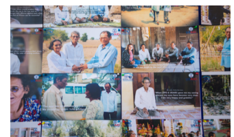
Photo extract from Documentary Video 'Former Khmer Rouge (KR) and Victim-Survivor (VS) for Healing and Reconciliation

TPO Cambodia has started project 'Promoting Gender Equality and Improving Access to Justice for Female and Survivors of Gender-Based Violence under Khmer Rouge Regime', phase II from January 2016 to December 2018