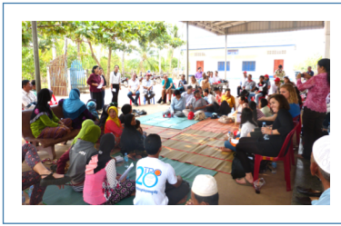
TPO staff introduced participants to TPO's work during field trip with GIZ staff in Kampot province

In the trip, some GIZ staff expressed their appreciation regarding TPO possessing strong relationships with local authorities, civil parties and intervention program for the Muslims group