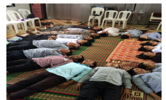
Relaxation exercises in the process of Training on Mobilizing Resource in Stressful Environment

After the training, the participants were asked to give feedback to TPO staff regarding any knowledge they gained during the training about different forms of stress, understanding of their own resources/coping skill styles, and how to use these skills when dealing with distressed individuals visiting the Tuol Sleng Museum. Participants were also informed that there would be a follow up workshop offered in the coming months focusing on more intensive stress management in the work place.