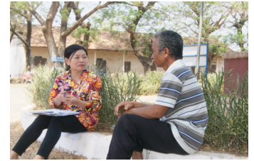
TPO's counselor conducted need assessment with community resource people

The objective of the launching event was to promote grassroots efforts of KR survivors in building better peace and reconciliation by sharing their success story at the national and international levels. These extraordinary efforts have helped Cambodian people cope with trauma and learn how to live peacefully together in the same communities, whether a former Khmer Rouge member or a survivor of the regime.