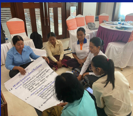
Local service providers participated in the reflection