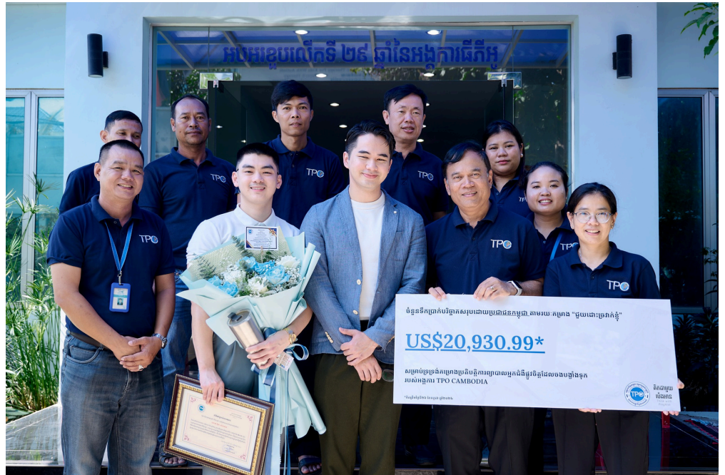
Fund Raising Campaign “ Think with PingAnn គិតជាមួយប៉េងអាន”