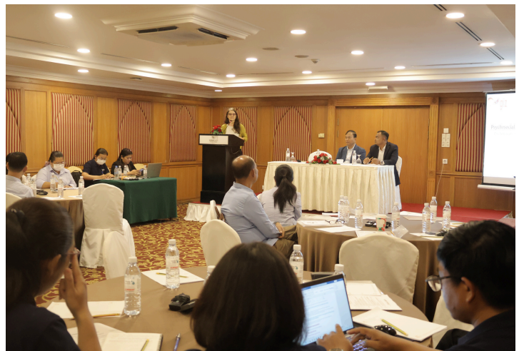
TPO Cambodia and Freie Berlin University Organized a consultation workshop on "Preliminary Results of a Research Study on the Psychological Impact of Khmer Rouge Victims Who Participated in the Extraordinary Chambers in the Courts of Cambodia (ECCC)"

This research aims to get insight in how your participation as a civil party or a witness affected your wellbeing and want to learn about your attitudes towards reconciliation today and in relation to the participation in the ECCC. The aim is also to better understand which factors of your participation at the ECCC you experienced as helpful or burdensome, to what extent your expectations with the participation of the ECCC