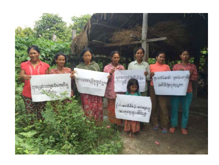
TPO's beneficiaries in Battambang province with key messages asking to stop domestic violence

Like us on https://www.facebook.com/tpocambodia for more updates.