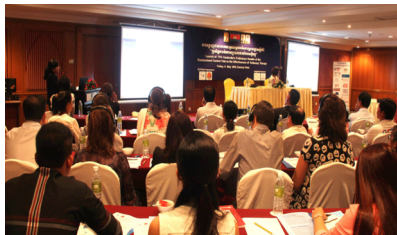
Launch of our research results on the Effectiveness of Testimony Therapy, 8 May 15 at Sunway Hotel, Phnom Penh

TPO’s Training Unit provides a number of courses for individuals, organizations and community groups to raise awareness and build technical