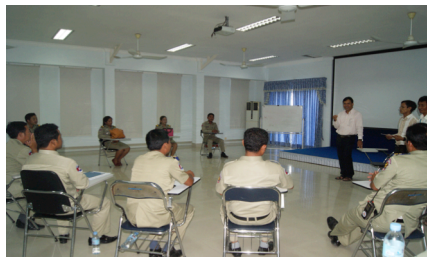
Prison staff attended a Primary Mental Health Care workshop, 30 Jun-2 July 15 at TPO's training center

On 2 July, at Meta House in Phnom Penh, we launched our new publication 'My Testimony' which contains the personal life stories of 10 survivors of the Khmer Rouge regime. More than hundred guests joined us and discussed the ongoing psychological impact of the regime on individuals and Cambodian society, and what can be done about it. For a copy of the publication in English or in Khmer, please contact TPO Cambodia via email admin@tpocambodia.org . This publication and the event were funded by GIZ.