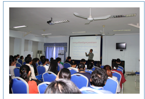
Workshop on Child Development on 25 May 15 at TPO's training center

The theme this year was 'Sustaining Gains and Integrating Domains'. The workshop provided an opportunity to all partners to discuss mental health counseling, monitoring and evaluation, and organizational skills to provide more effective treatment for torture survivors. This included sharing their organization's progress over the past four years through the support of the PATH Project. Also, all partners had the chance to see and learn more about the great work of CVT's partner organization in Georgia (Empathy Center) and to build a community across all areas of technical expertise and share the overall vision after the end of PATH project. TPO was offered time to present the results of our research study on the 'Effectiveness of Testimonial Therapy' funded by CVT and also shared