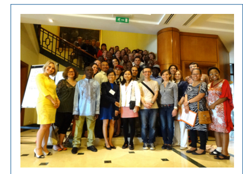
Group photo with all CVT partners who attended the PATH workshop from 1-5 June 2015 in Georgia

TPO will also be working closely with government at national and sub-national levels, as well as NGOs in the community to build a stronger protective family environment to improve prevention of abuse and offer better child protection responses.